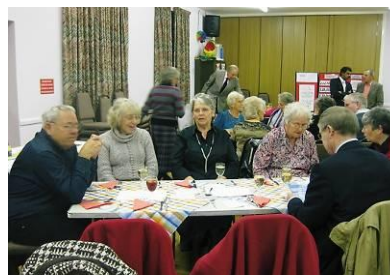
Some of the happy throng